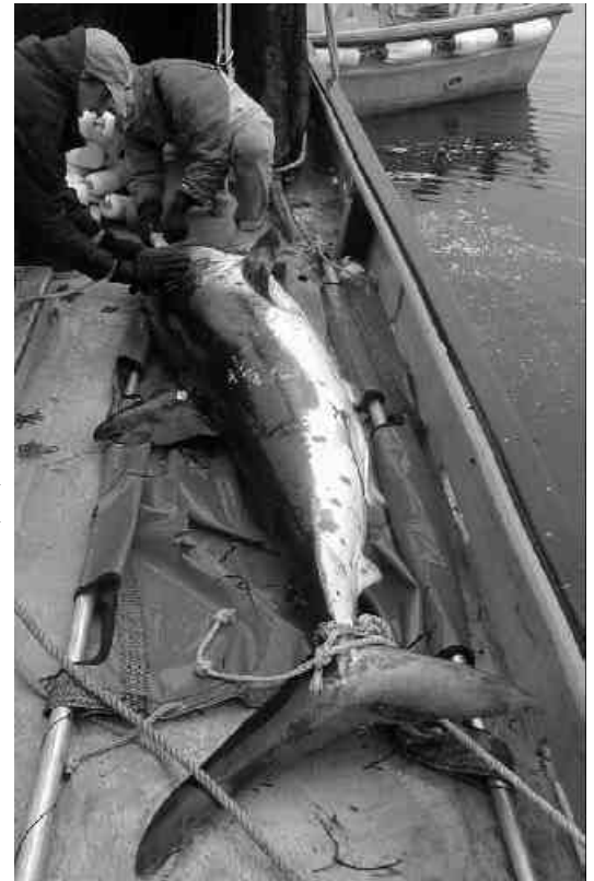
Biologists lavage the stomach of an adult female salmon shark in Prince William Sound, July 1999.

Large surface aggregations of salmon sharks in the eastern GOA in recent years have drawn attention of commercial and sport fishers, popular press, and biologists. The NMFS Auke Bay Laboratory conducted a pilot study of salmon sharks in PWS in 1999—the first sampling effort ever directed at salmon sharks in the eastern Pacific. The study collected data on diet composition and trophic interactions, fatty acid composition, stable isotopes, population genetics, population biomass, seasonal distribution, and demographics. Scientists from ADF&G, Virginia Institute of Marine Science, Stanford University, and National Geographic were also involved. This collaborative work will shed light on the biology, ecology, and demographics of this poorly understood species and its role as predator in Alaska waters. 🐟