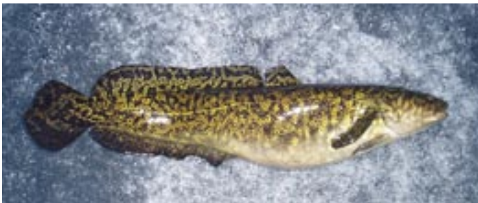
Example of a lake resident burbot, caught in late winter while sport fishing.

Burbot, Lota lota , are not the most attractive fish, and generally do not fight hard; however, they are popular with sport anglers because of their table quality. They have a delicate white meat, a treat for those of us living away from the coast. Burbot are the only freshwater cod species in North America and have mottled skin that ranges in color from black to grey to olive and even yellow. They have elongated dorsal and anal fins that extend all the way to a rounded caudal fin and a distinct single soft barb on their lower jaw. They are a relatively long-lived, slow growing fish and in Alaska, typically do not reach sexual maturity until age six or seven. A trait that sets them apart from other freshwater fish is that they spawn in mid to late winter.