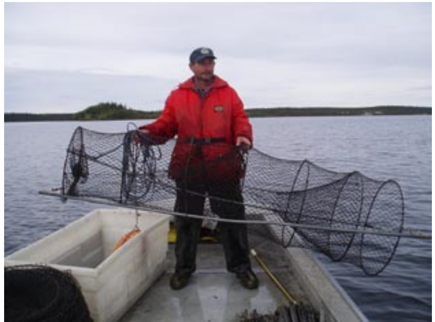
Ready to set a hoop trap on a nice calm day (Lake Louise, Spring 2005).